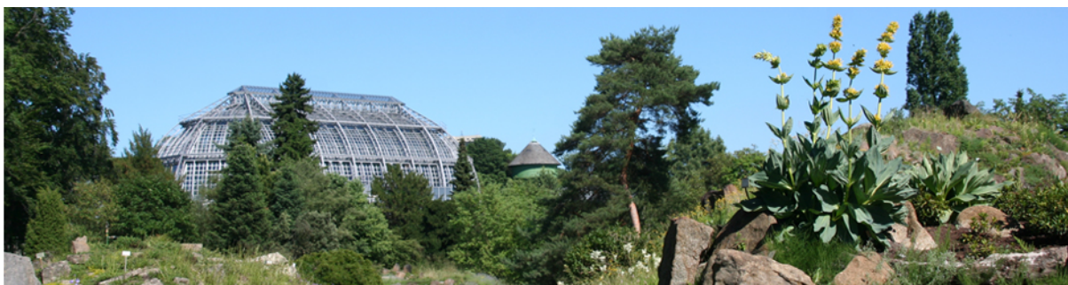
The Botanic Garden in Berlin-Dahlem ( www.bgbm.org )